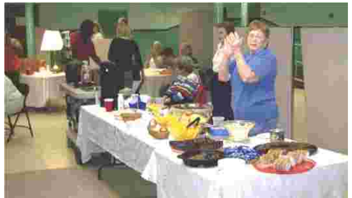
The food table at the coffee house